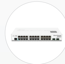
Cloud Router Switches